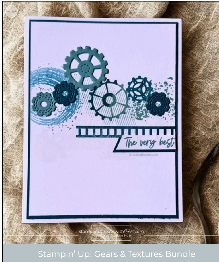
Stampin' Up! Gears & Textures Bundle

A masculine card turned into an adventure!