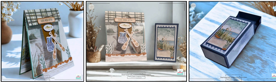
A Paper Pumpkin Thing Blog Hop